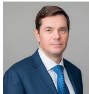
Mr. Aleksei Mordashov, Chairman of the Board, Severstal