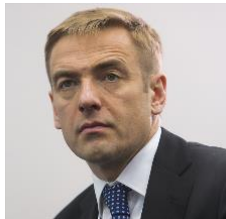
Mr. Viktor Evtukhov, Deputy Minister of Industry and Trade of the Russian Federation