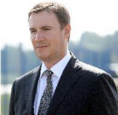
Mr. Dmitriy Patrushev, Minister of Agriculture of the Russian Federation