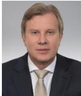
Mr. Vitaliy Saveliev, Minister of Transport of the Russian Federation