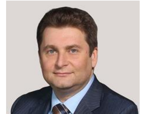
Mr. Aleksandr Morozov, Deputy Minister of Industry and Trade of the Russian Federation