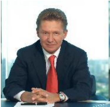
Mr. Alexey Miller, Chairman of the Board, GAZPROM