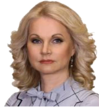
Mrs. Tatiana Golikova, Deputy Prime Minister of the Russian Federation