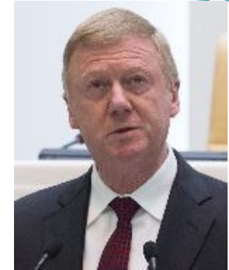
Mr. Anatoliy Chubais Presidential Envoy for the International organizations