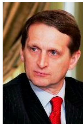
Mr. Sergey Naryshkin, Director, Intelligence Service of the Russian Federation